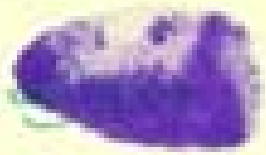
Signature of the Deponent:

LTA [Handwritten signature] 2009 2005 2008